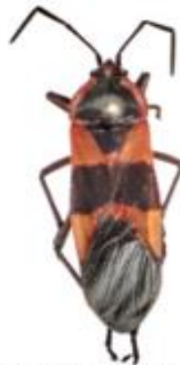
Large milkweed bug