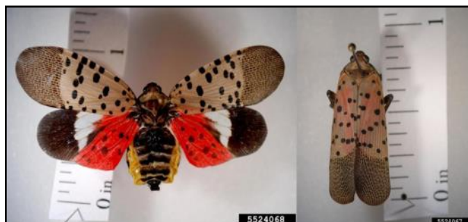
Figure 1: Adult spotted lanternflies are distinct looking insects; their fore wings are half spotted and half reticulated, while the back wings are a mixture of black, white, and red. On the left, the wings are open and showing all of the color; on the right is how the insect is most likely to be encountered– with the wings closed over its back.

Spotted lanternflies develop through a process called incomplete metamorphosis. This means that the female lays eggs, which will hatch to reveal “nymphs,” immature insects that vaguely resemble the adult. They gradually get larger during the growing season, eventually developing their wings and becoming adults. SLF starts off black with white dots, and then before becoming adults, develop red markings.