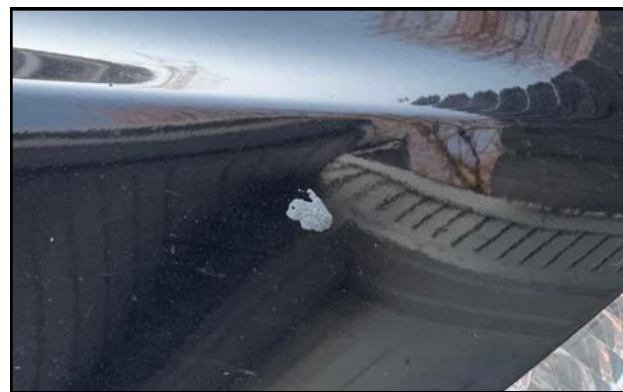
Figure 4: A mass of spotted lanternfly eggs has been laid on this vehicle. The eggs will hatch the following spring if not removed.