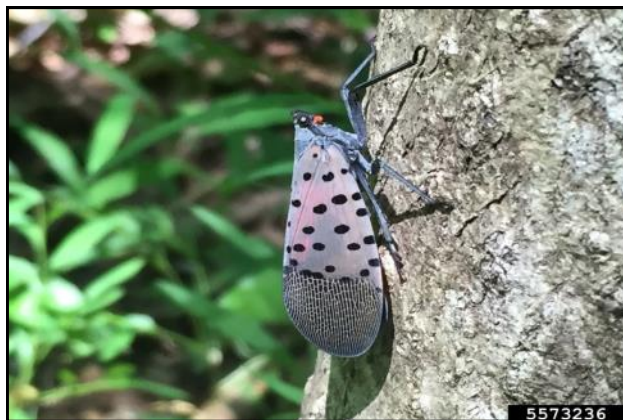
Figure 3: Spotted lanternflies feed on tender growth as nymphs before moving on to feed on the trunk and branches of trees as these bugs get larger and stronger.